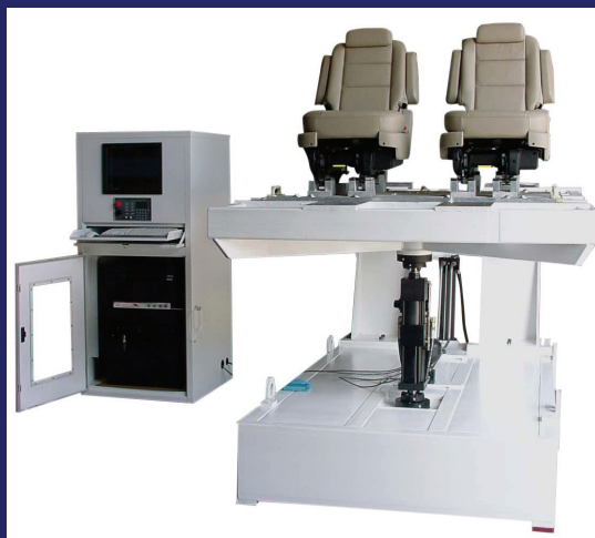
Pitch table for BSR testing of seats- integrated with B&K noise and analysis system

DTE configures systems ranging from simple single axis vertical to rotary vibration, and has extensive experience with multi-degree of freedom vibration systems. (See images at right.)